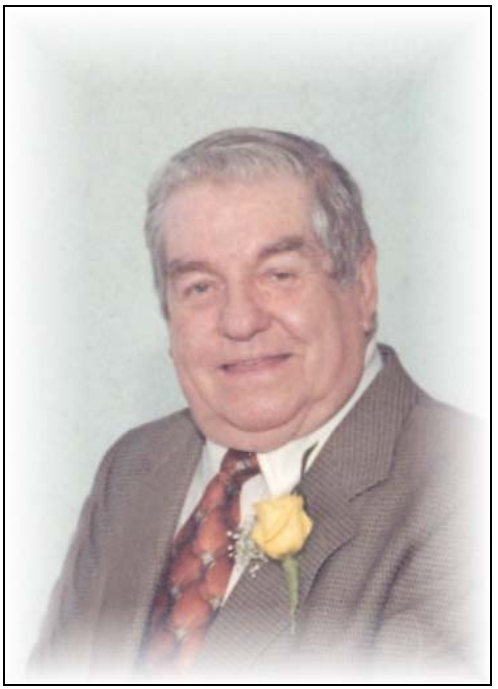
3/17/27 - 5/22/05