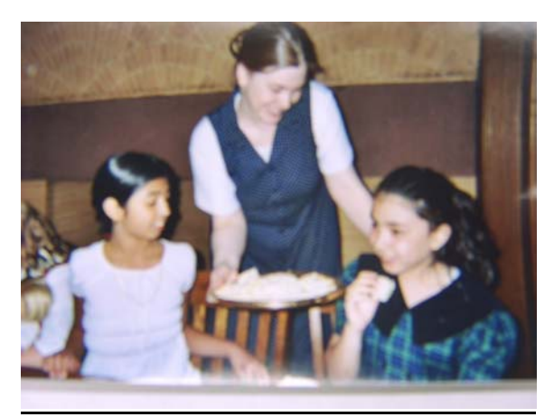
Tea sandwiches are being served

That quote is now an anachronism, or Mr. Masson just hasn't been in a Massachusetts library lately. Statewide delivery of Library materials in all formats reached over 10 million items. In 2005. 1.3 million items circulated in our regional delivery area. Ludlow experienced a 69% increase in loans from/to other libraries. 18,500 items in all formats from/to Ludlow.