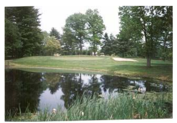
Westover Golf Course, Hole #8

Additionally, the Commission thanks its patrons; it has been a pleasure to serve your needs over the past golf season and we look forward to that continued service. To the residents of the Town of Ludlow, we look forward to providing a self sufficient facility, at no direct cost to the tax payers, for use and enjoyment by the residents at a continued reasonable cost.