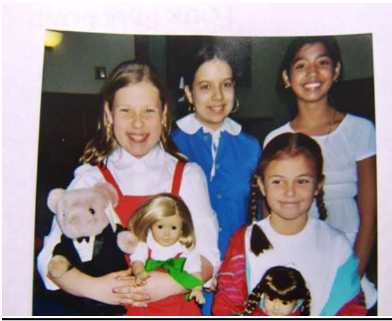
Girls Dressed Like Their American Girl Dolls

The Board of Library Trustees plays a crucial role in providing library and information services to the community. Our Trustees promote the mission of library, setting appropriate policies for library services, advocating for library issues and funding. The Board has given willingly of their time, experience, and guidance.