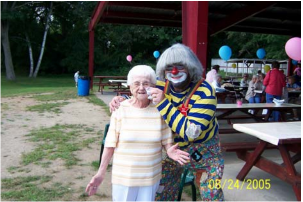
Picnic in the Park

the new program were fully informed as to what was the best program for them. The next step was how to fill out the necessary forms to join the program. The jump in energy costs, electric, gas, and oil was another obstacle that had to be dealt with, not only with the elder population but with anyone who was having difficulty making ends meet. Through home visits and office visits seniors were educated about the many services that could be provided for them so that they could maintain the quality of life that they are accustomed to. Quality of life for the seniors in Ludlow is a major goal for the Outreach Department at the Ludlow Senior Center. If you have any questions or are looking for any information to what services or financial assistance you may be entitled to stop by, call or email, outreach@ludlow.ma.us, me in the Outreach Department today.