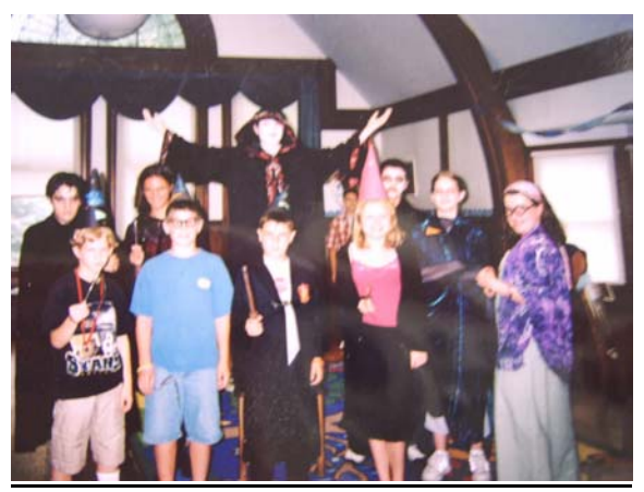
Summer Teen Volunteers- Harry Potter Party

Our library remains essential as a community center, where children are educated, lifelong learning is supported, public access to information and educational programs is provided. Library users are borrowing more; the library saw a 5-6% increase the circulation of print materials, and a 26% increase in audio circulation, due to the expanded CD book collection. Patron registrations went up 22% over 2004. Circulation to residents of other municipalities rose 18%. Over 2500 people attended 225 community meetings held by non-profit groups, government agencies, and home school groups.