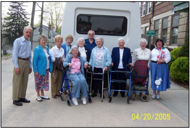
Volunteer Recognition Day

Another year may have passed us by, but our programs and activities continue to flourish with our many exercise programs leading the way. Many seniors have vowed that in 2006 they will try to be in better shape and eat healthier with our programs geared to that goal. Tai Chi, Yoga, Weight Training, Jazz Dance, Indoor Tennis, Walking Club, Water Fitness, Volleyball, and our up-dated Fitness Room have enticed many of our elders to get moving and participate in these classes.